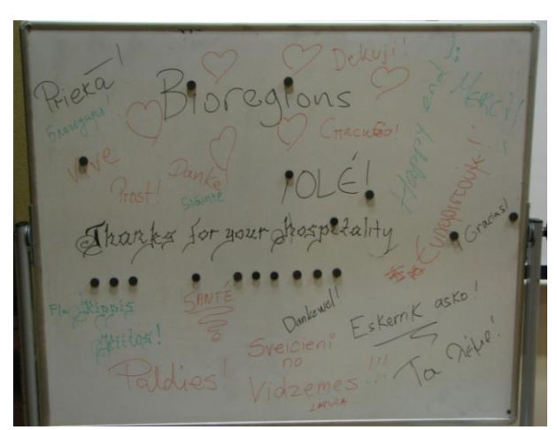
Figure 11 Greetings board of the BioRegions project