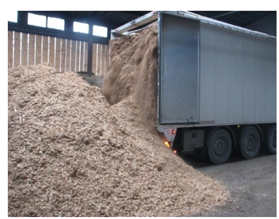
Figure 7 Woodchips supply to the BBS