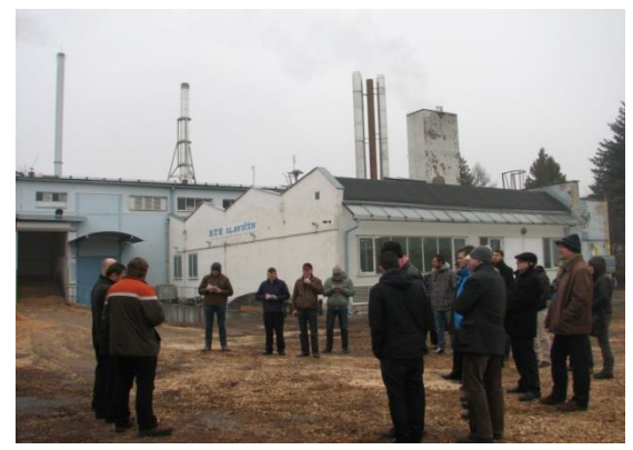
Figure 4 Welcoming at Malé Pole boiler house in Slavičín