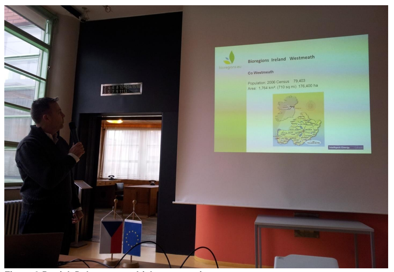
Figure 3 Patrick Daly presents Irish target region