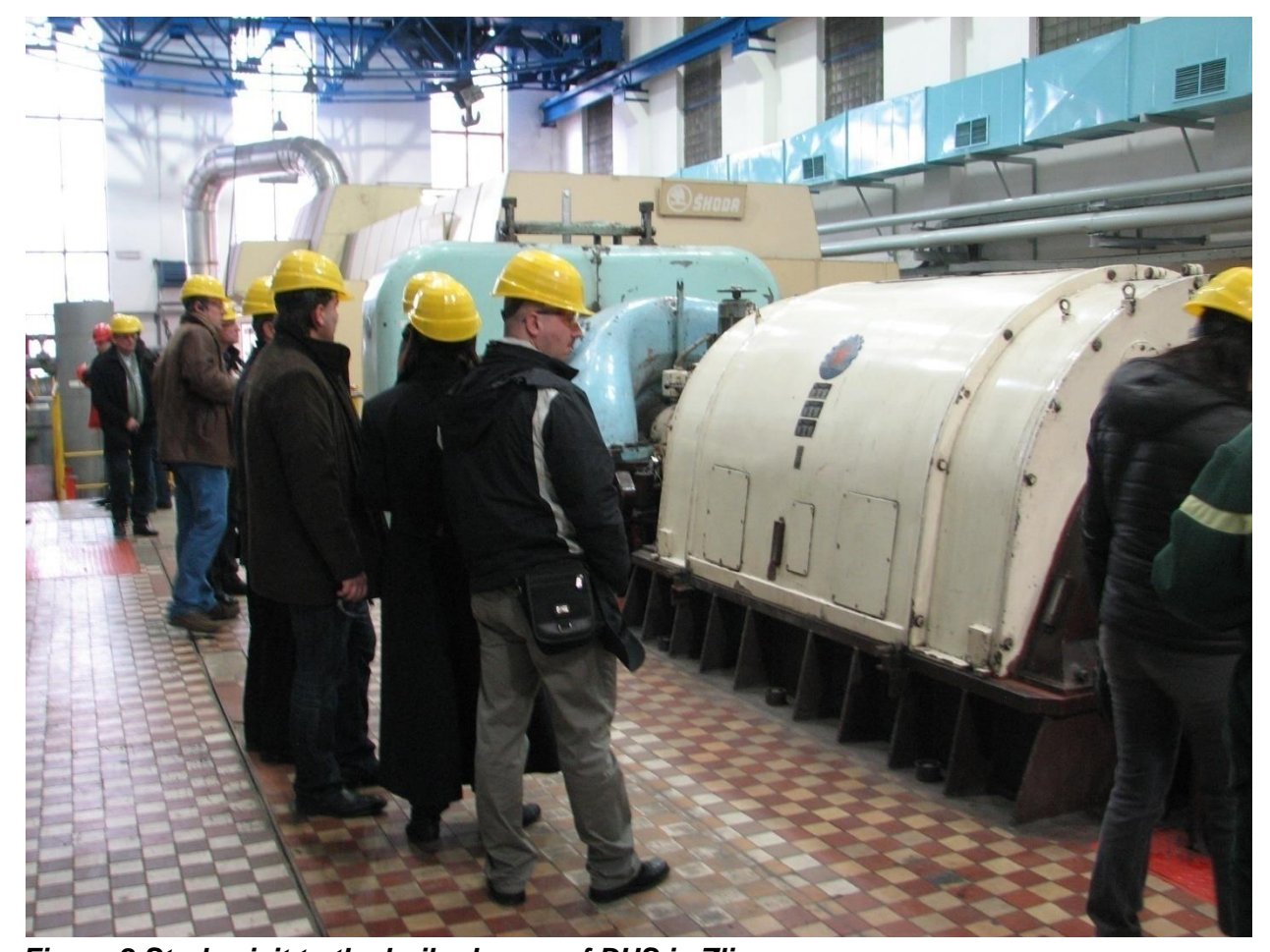
Figure 2 Study visit to the boiler house of DHS in Zlin