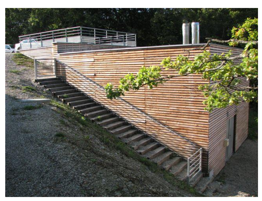
The boiler house with wood chips storage (top left)